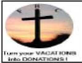
Turn your VACATIONS into DONATIONS!